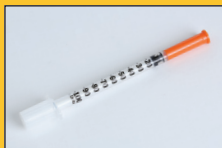
Syringe and injection needle