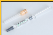
Pre-filled syringe with diluent (liquid) and 25-gauge mixing needle