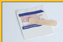
Dry sterile gauze, cotton ball or adhesive bandages