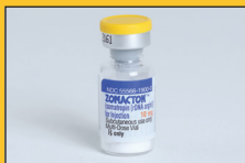
ZOMACTON 10 mg (powder)