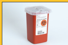
Sharps disposal container

ZOMACTON or diluent should not be used in patients with a known sensitivity to any of its ingredients.